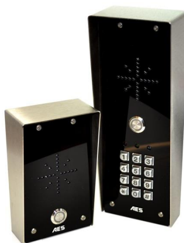
Traditional Hooded range