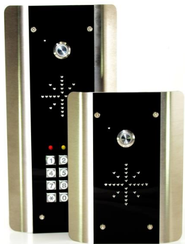
Curved Architectural range