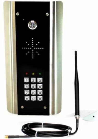
(standard model) GSM-4AB (keypad model) GSM-4ABK