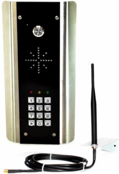
(standard model) GSM-3AB (keypad model) GSM-3ABK